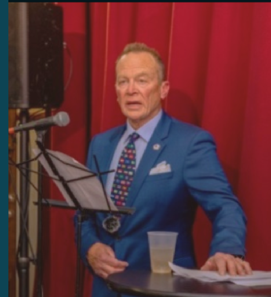
Robin McGraw delivering an incredibly inspirational reflection on the power of Brien and mental health care.